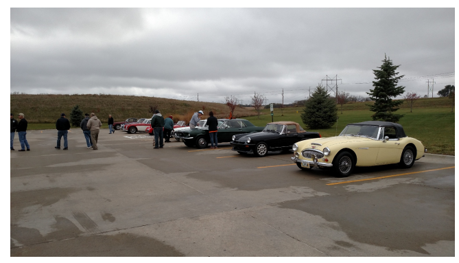
Pit stop at the Antique Mall