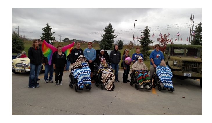
I will crush you!!

Again, thanks to Bart and all who participated.