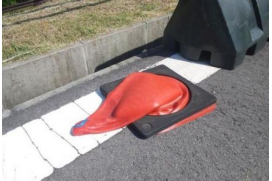
The temperatures and humidity make it just too hot to autocross.

Holiday Party January 19, 2014, 12:30 pm