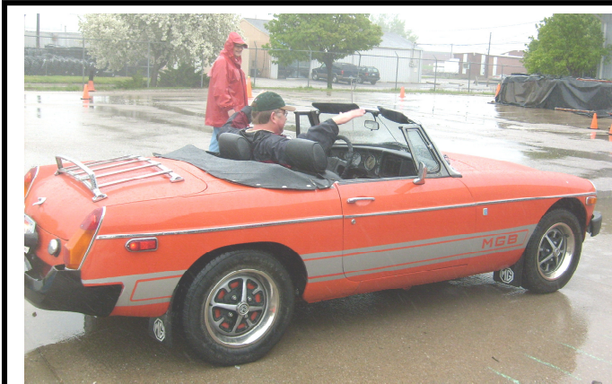
Quintessential British Sunshine