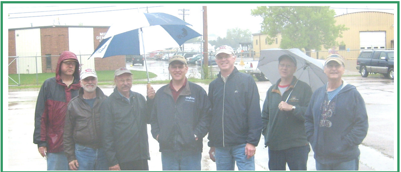
THE FEW, THE PROUD, THE ???? FUNKANA DRIVERS