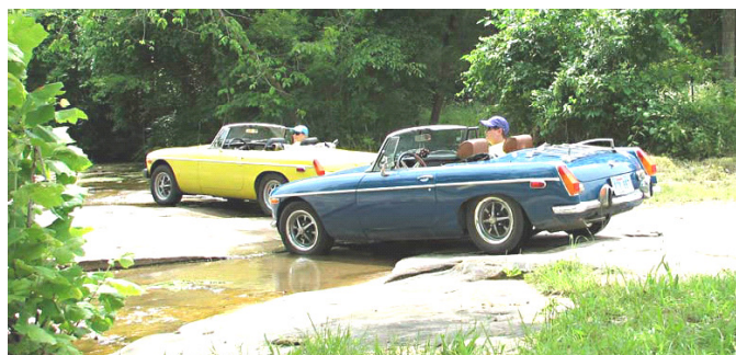
LBC's FORGING A STREAM IN ARKANSAS