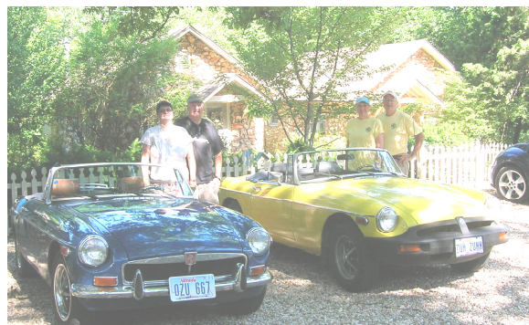
LIFE IS GOOD AT THE ROCK COTTAGES IN EUREKA SPRINGS

(*)LBC Pessimist: Someone that, after a heavy rain, sees the car as “half-empty” instead of “half-full”.