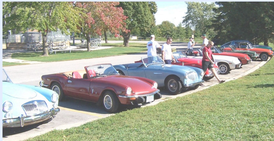
Last years TSD Rally Line up