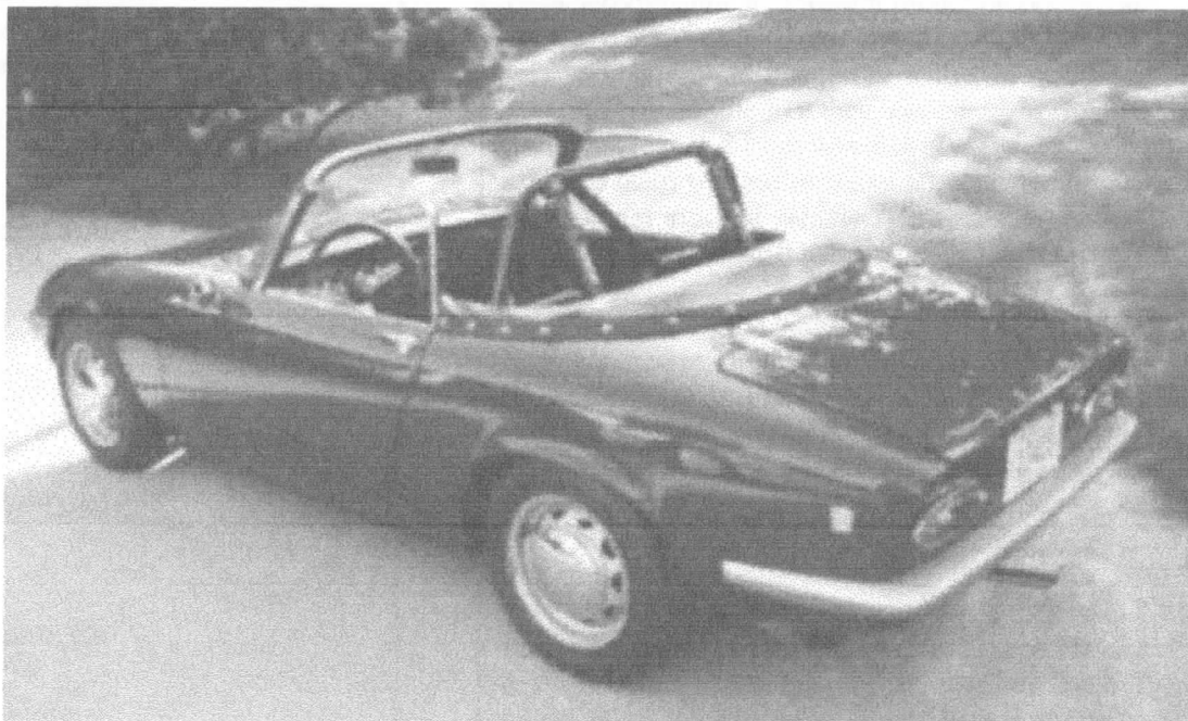
Jay and Liz Fluehr's 1967 Lotus Elan 1600 Twin Cam