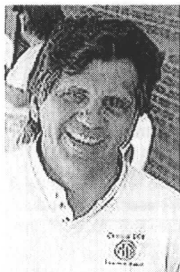
By Marvin Marshall

Lincolmites meet at the 84th and Cornhusker "U-Stop" gas station no later than 8:30 a.m. We'll probably take Highway 6 to the Mormon Bridge exit.